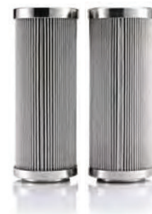
SAMPLE DEMINERALIZED WATER FILTERS