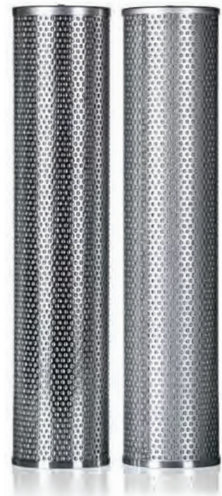
SAMPLE LUBE OIL AND LIQUID FUEL FILTERS