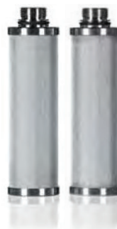
SAMPLE SEAL GAS FILTERS