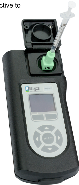
ANDalyze 1100 Handheld Fluorometer works with all ANDalyze Sensors

Lead Copper Uranium Mercury Cadmium Zinc